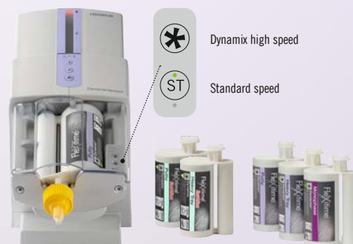
Cartridges marked with Dynamix speed Symbol *